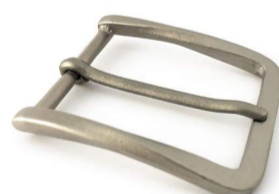
matt steel € 5,90