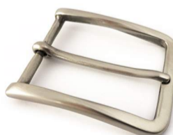
satin steel € 7,40