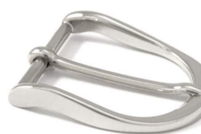
AC003/35 € 6,90