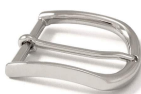
AC002/35 € 6,90