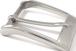
AC005/35 € 6,90