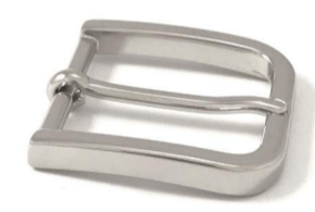
AC004/35 € 6,90