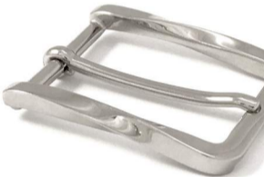
AC006/35 € 6,90