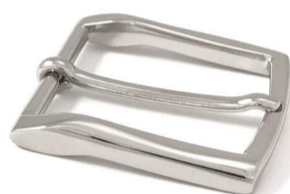
AC001/35 € 6,90

it is composed of 6 different models with 35mm height all offered with stock service facility and no minimum order quantity is required*