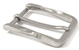
shiny steel € 6,90