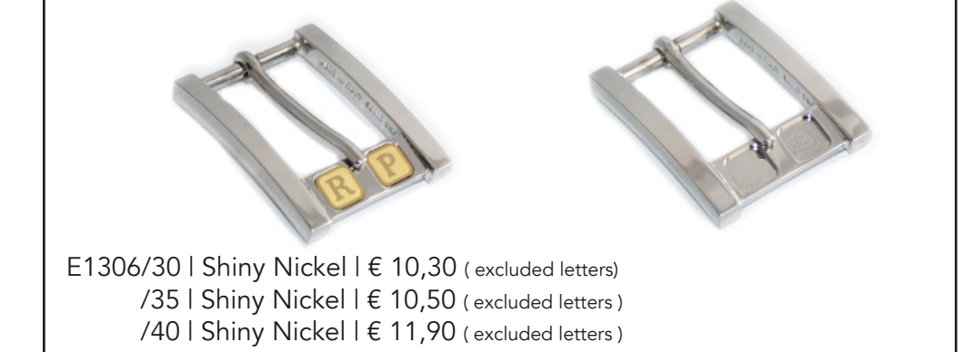
P10 - AVAILABLE LETTERS IN GOLD AND NICKEL. € 1,00/pz