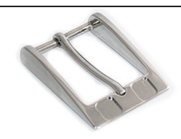
E1302/30 | Shiny Nickel | € 8,25 (excluded letters) /35 | Shiny Nickel | € 8,80 (excluded letters)