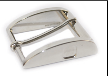
E1300/30 | Shiny Nickel | € 9,85( excluded letters) /35 | Shiny Nickel | € 9,90 ( excluded letters) /40 | Shiny Nickel | € 10,05 ( excluded letters)